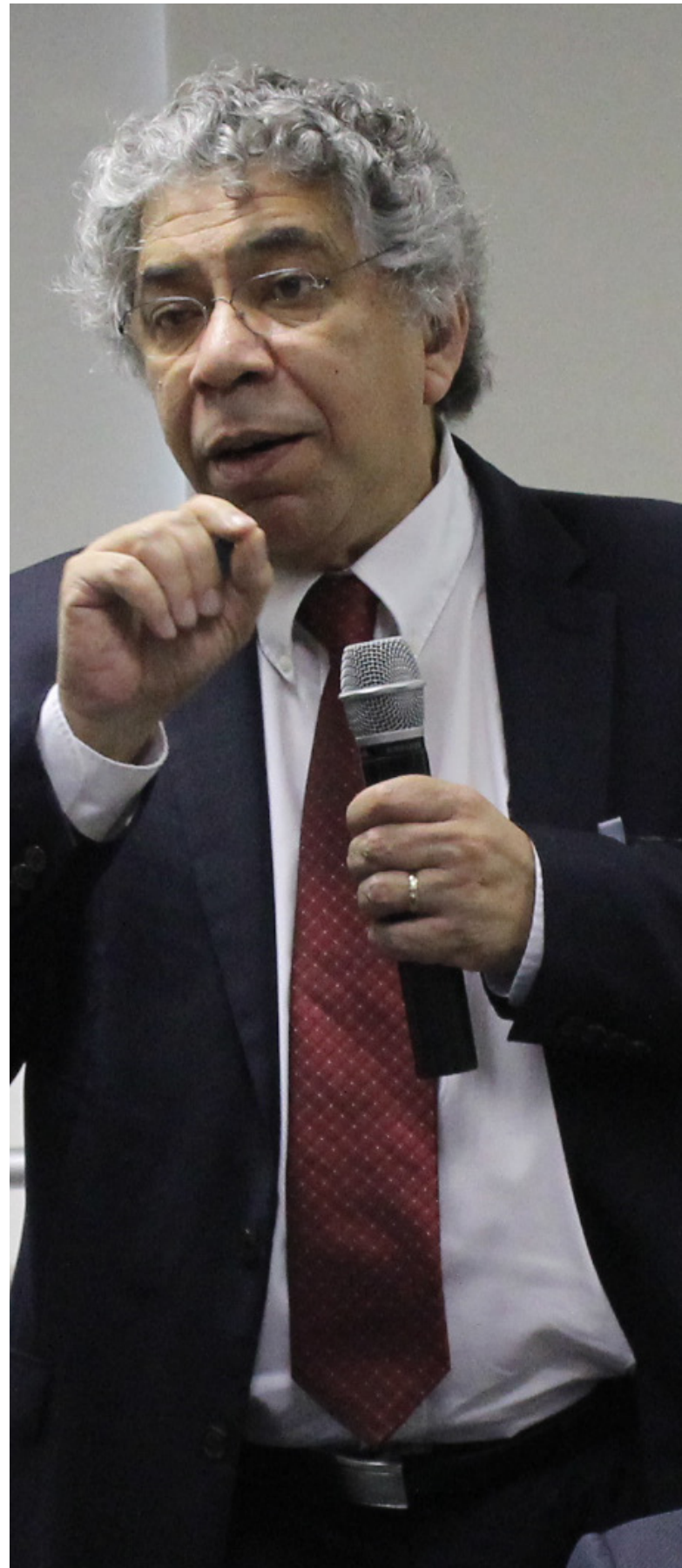
Otaviano Canuto at the Conference in Rio

Canuto, O; Fleischhaker, C; George, S.; 2016. Brazil at the Crossroads. EconoMonitor [online], 28 April 2016. Available from: http://www.economonitor.com/blog/2016/04/brazil-at-the-crossroads-2/ [Accessed 27 January 2017].